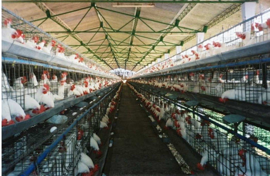
ELEVATED PLATFORM CAGE LAYER HOUSE